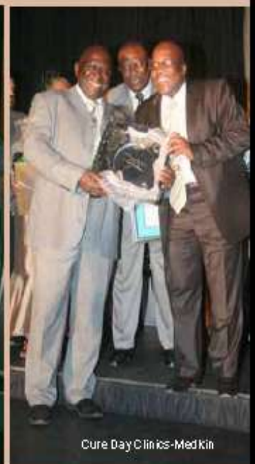
Cure Day Clinics-Medkin